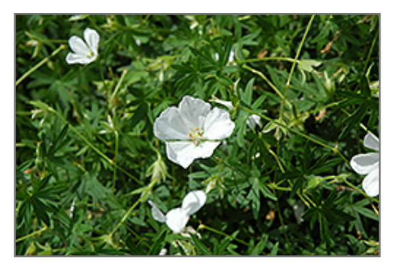
White Cranesbill flowers