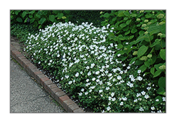
White Cranesbill in bloom

White Cranesbill has masses of beautiful white flowers at the ends of the stems from late spring to mid summer, which are most effective when planted in groupings. Its deeply cut lobed palmate leaves are dark green in color. As an added bonus, the foliage turns a gorgeous dark red in the fall.