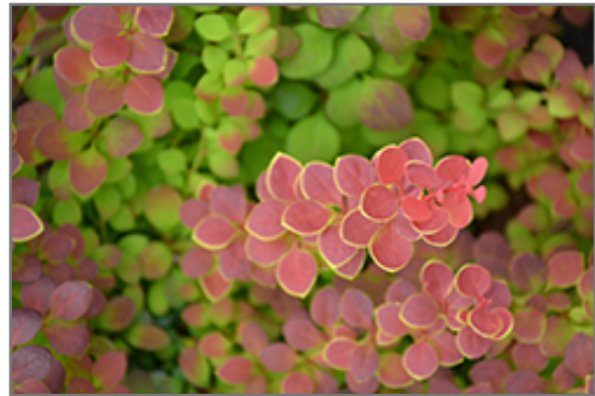
Sunjoy Tangelo Japanese Barberry foliage