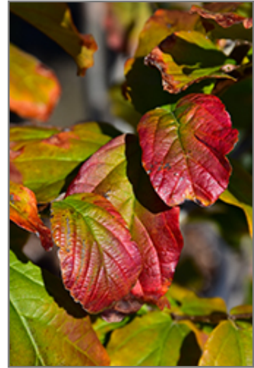
Ruby Vase Parrotia in fall

This tree should only be grown in full sunlight. It is very adaptable to both dry and moist locations, and should do just fine under average home landscape conditions. It is not particular as to soil type or pH. It is highly tolerant of urban pollution and will even thrive in inner city environments. This is a selected variety of a species not originally from North America.