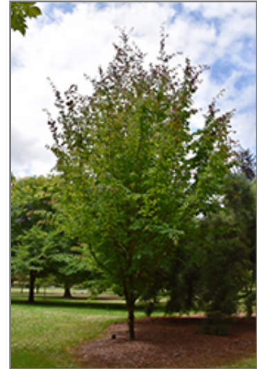
Ruby Vase Parrotia