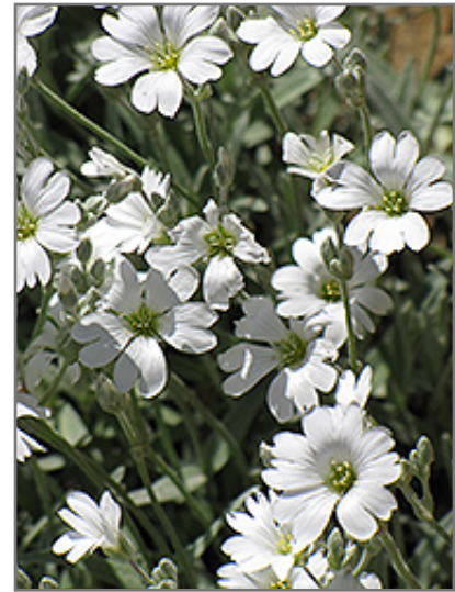
Snow-In-Summer flowers