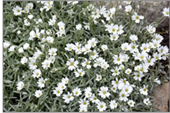
Snow-In-Summer flowers