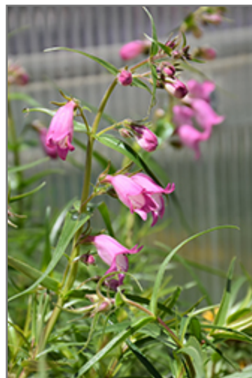
Carolyn's Hope Beard Tongue flowers