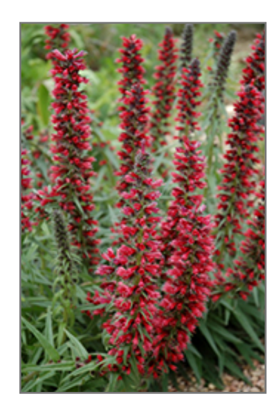
Red Feathers flowers

Red Feathers is an herbaceous evergreen perennial with tall flower stalks held atop a low mound of foliage. Its medium texture blends into the garden, but can always be balanced by a couple of finer or coarser plants for an effective composition.