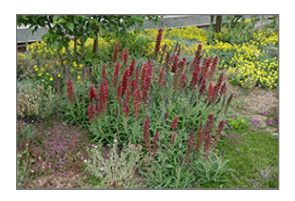
Red Feathers in bloom

This plant will require occasional maintenance and upkeep. Trim off the flower heads after they fade and die to encourage more blooms late into the season. It is a good choice for attracting bees, butterflies and hummingbirds to your yard, but is not particularly attractive to deer who tend to leave it alone in favor of tastier treats. Gardeners should be aware of the following characteristic(s) that may warrant special consideration;