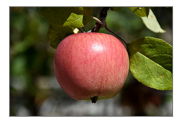
Prairie Magic Apple fruit