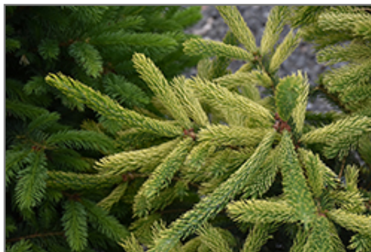
Mac's Golden White Spruce foliage