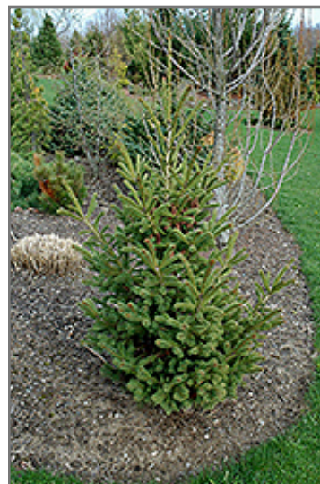
Mac's Golden White Spruce