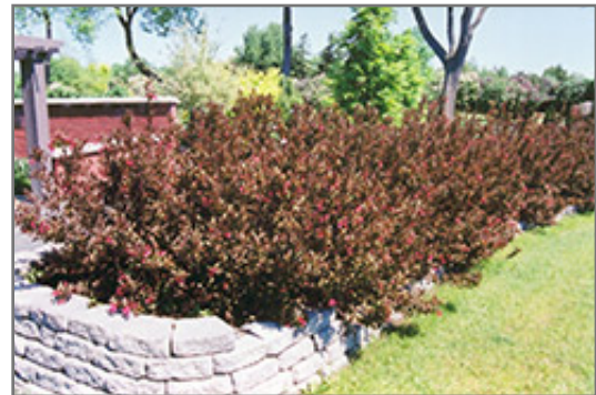
Wine and Roses Weigela