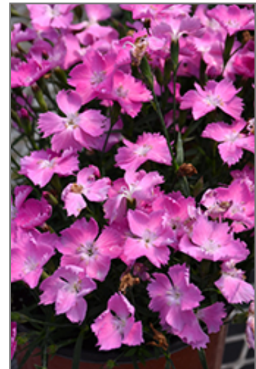
Beauties Kahori Pink Pinks flowers