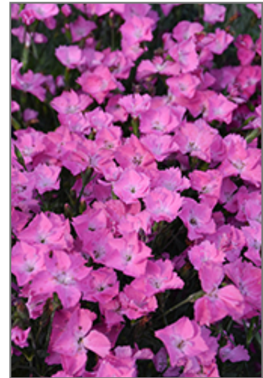
Beauties Kahori Pink Pinks flowers

Beauties Kahori Pink Pinks is recommended for the following landscape applications;