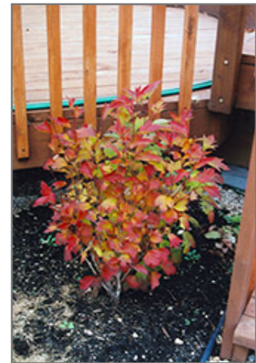
Compact Highbush Cranberry in fall