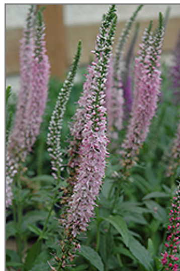
Fairytale Speedwell flowers