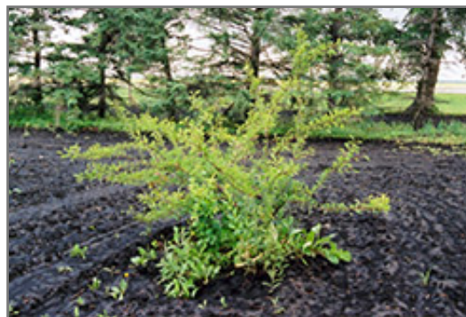
Sapalta Cherry-Plum